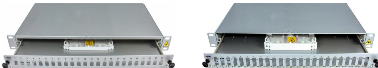
PSP-EE-1U-24 ODF - SC/E2 simplex and SC duplex

PSP-EE series telecommunication optical distribution frame dedicated for installation in 19" and 21" cabinets or racks.