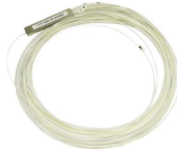
PLC Splitter Mini Box without connectors